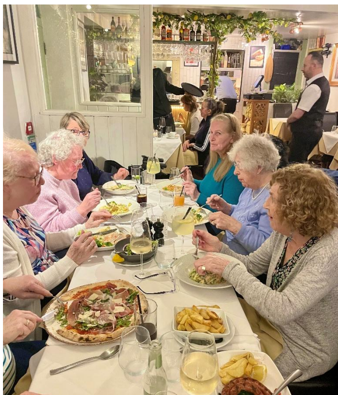
Marple U3A group enjoying a meal at the recently opened D'Oro restaurant in Marple.