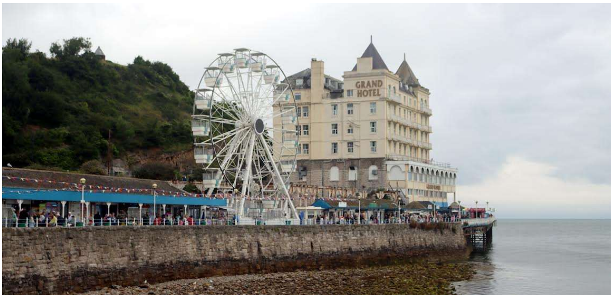
The Grand Hotel Llandudno - Colin Hughes

Members are reminded that they are supposed to bring their membership cards when they first take part in group activities and that group organisers are required to make a note of who attends.